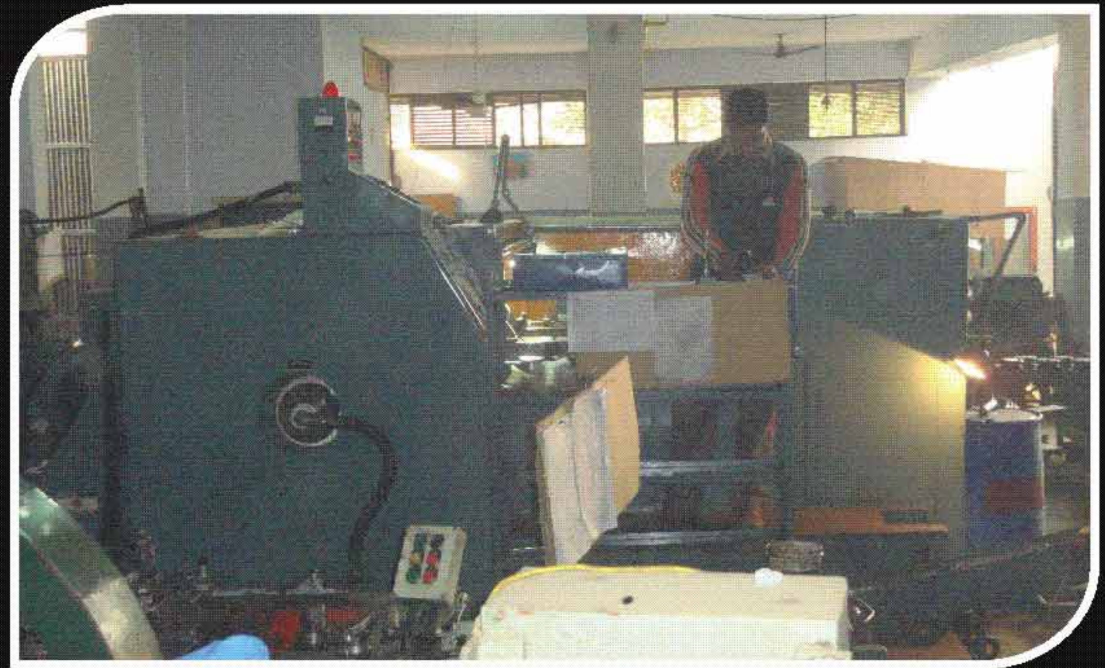
Cold Forging Unit : Shede - II