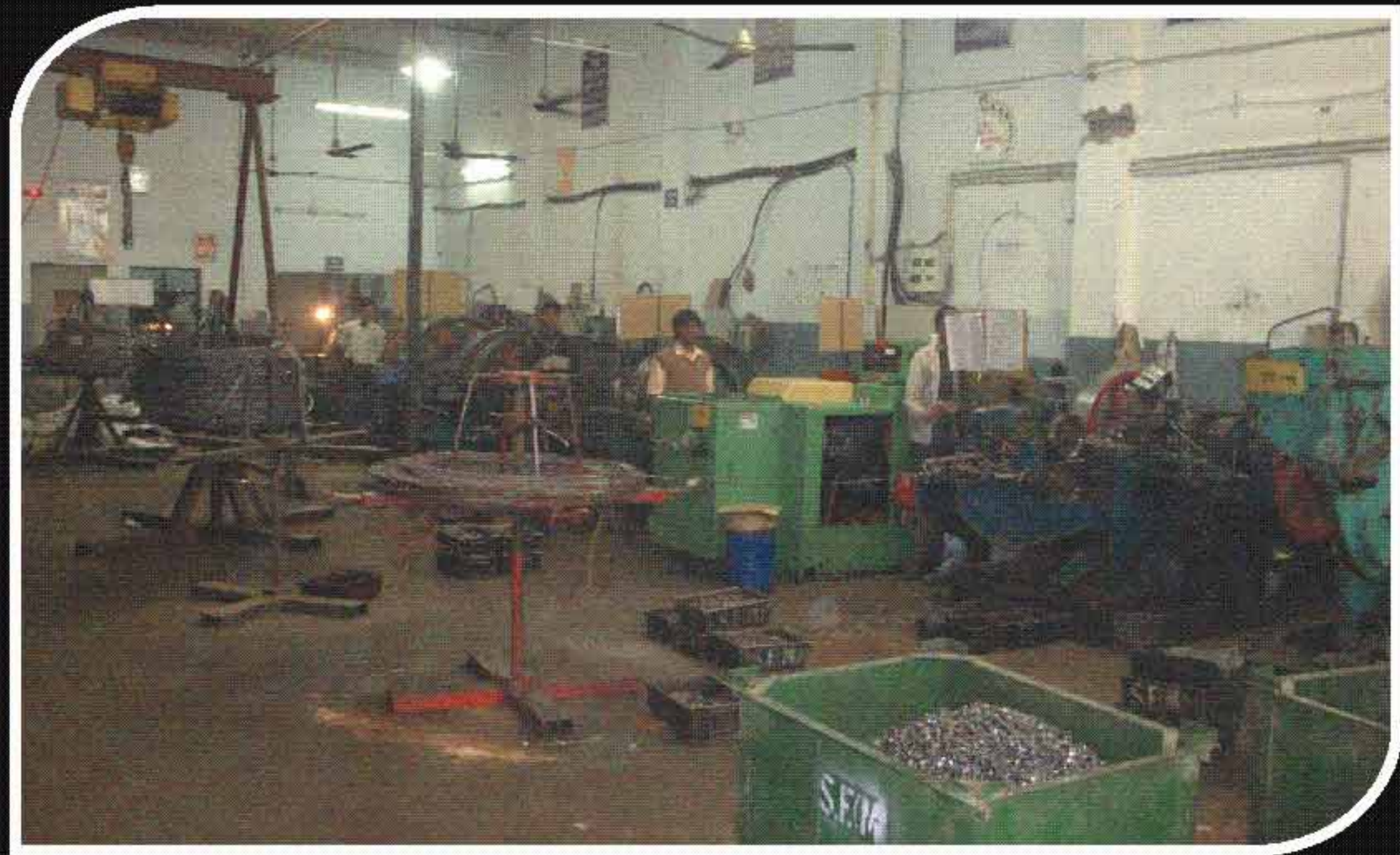
Cold Forging Unit : Shede - I