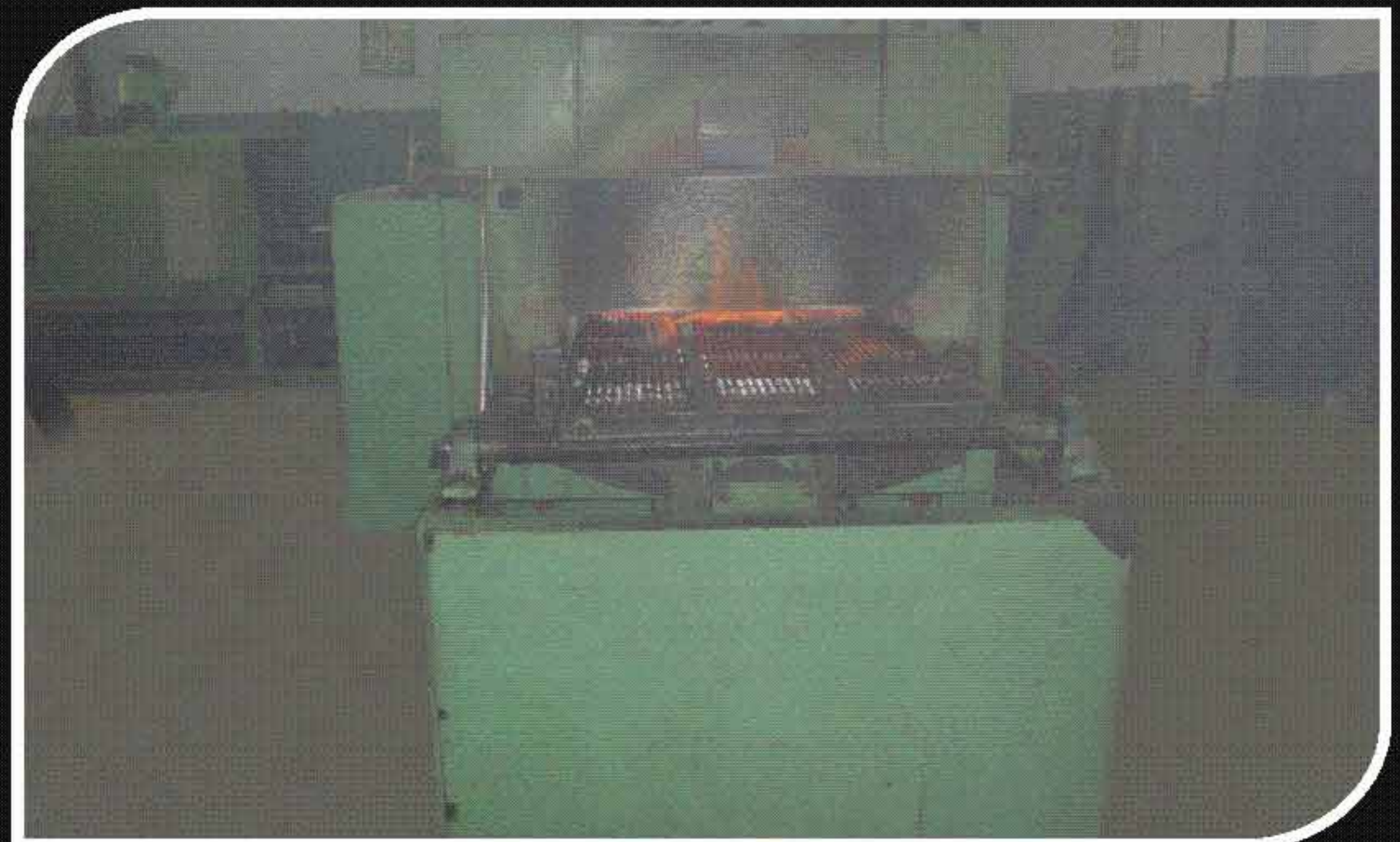
Heat Treatment Facilities